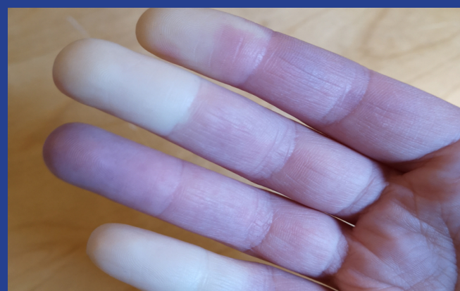
Among the many injuries that can be caused by vibrations are nerve and circulatory damage resulting in Raynaud's phenomenon, or "white finger" .