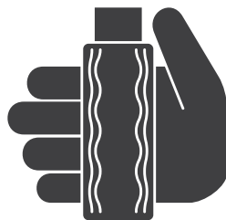
MINIMIZE VIBRATION AND SHOCK