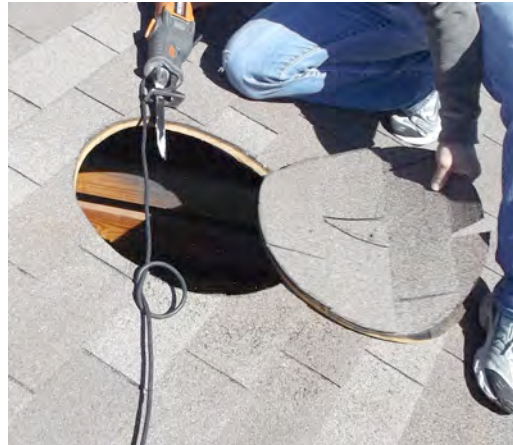
The hole cut out