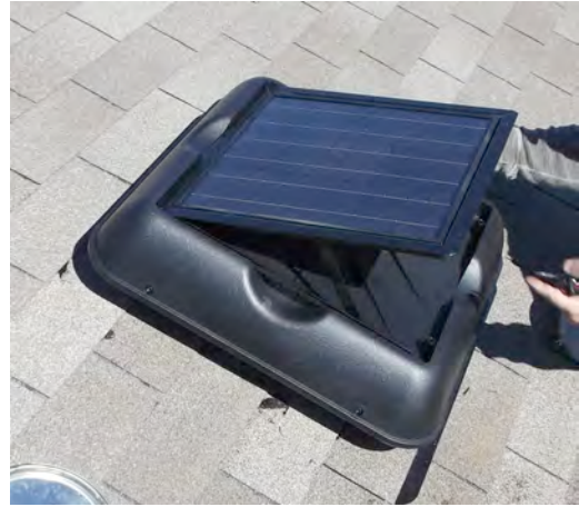
Raising the solar panel