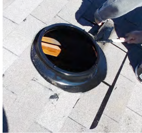
Sealing the flashing