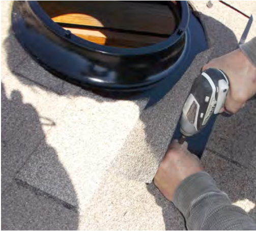
Securing the flashing