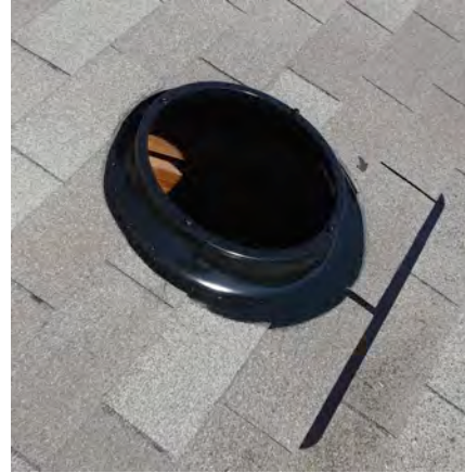
*Flashing after being slide in

*If possible and to make it look cleaner, replacing the shingles on the bottom third of the flashing. This is not a requirement, just optional.