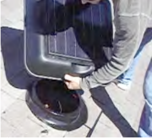
Attaching the hood