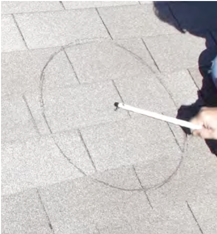
Measuring the hole

On either 24"/16" center construction, we recommend cutting a 15" round hole between the rafters. We recommend installing the SR1800 between the rafters but if not possible it is OK to install the SR1800 over a rafter. We recommend marking the cut by connecting a nail to string or rope and inserting the nail at the center of the hole. Measure 7.5" out and connect a second nail to the string or rope. Use the second nail to score a line in the roof. When you are sure the measurements are correct, make the cut with a reciprocating saw. >>Remember to measure three times and cut once.