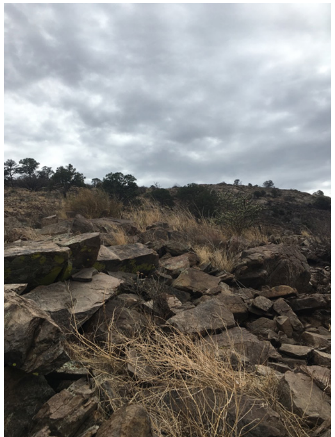
L: Area of operations for ST137; R: View toward tummit where the landing zone was established.