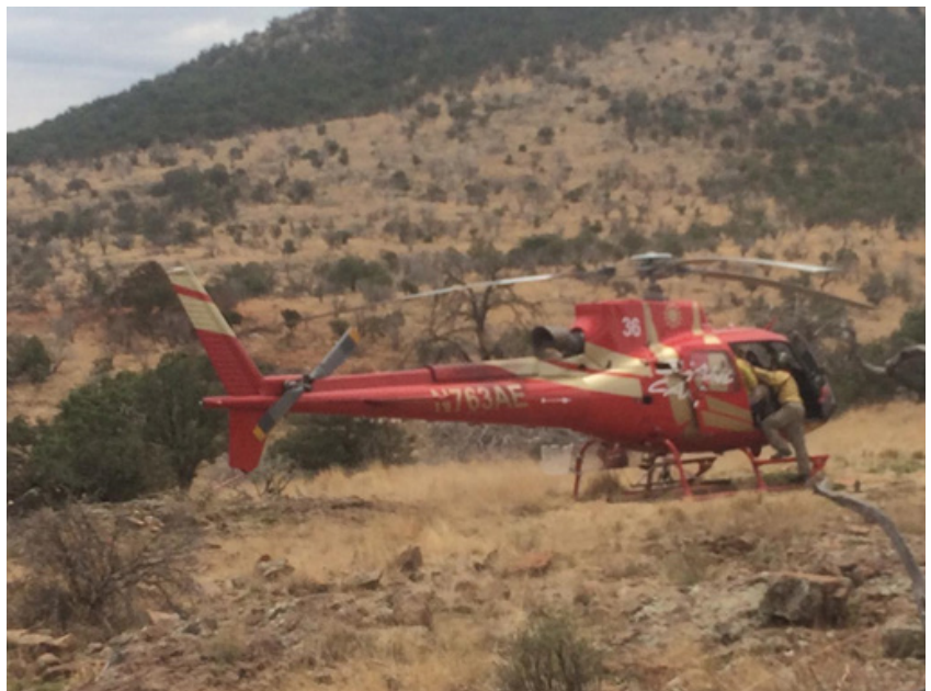
A: Location of landing zone R: Aircraft on the ground, preparing for transport