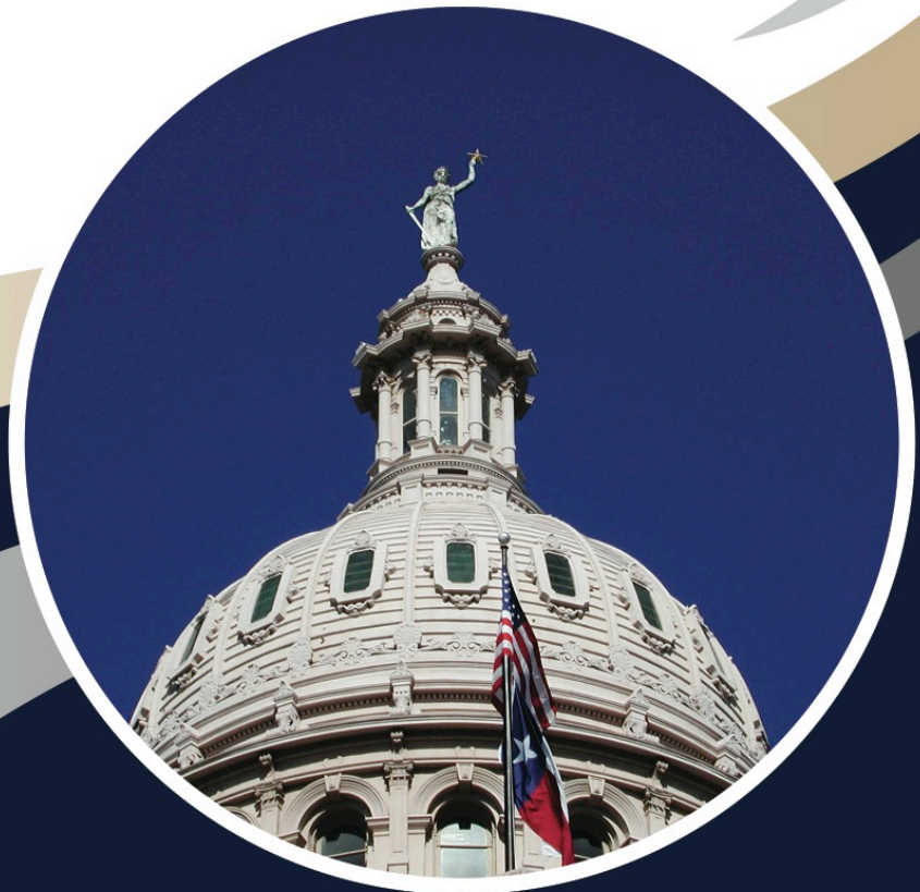
Exhibit E Texas Windstorm Insurance Association Rating Rules Manual