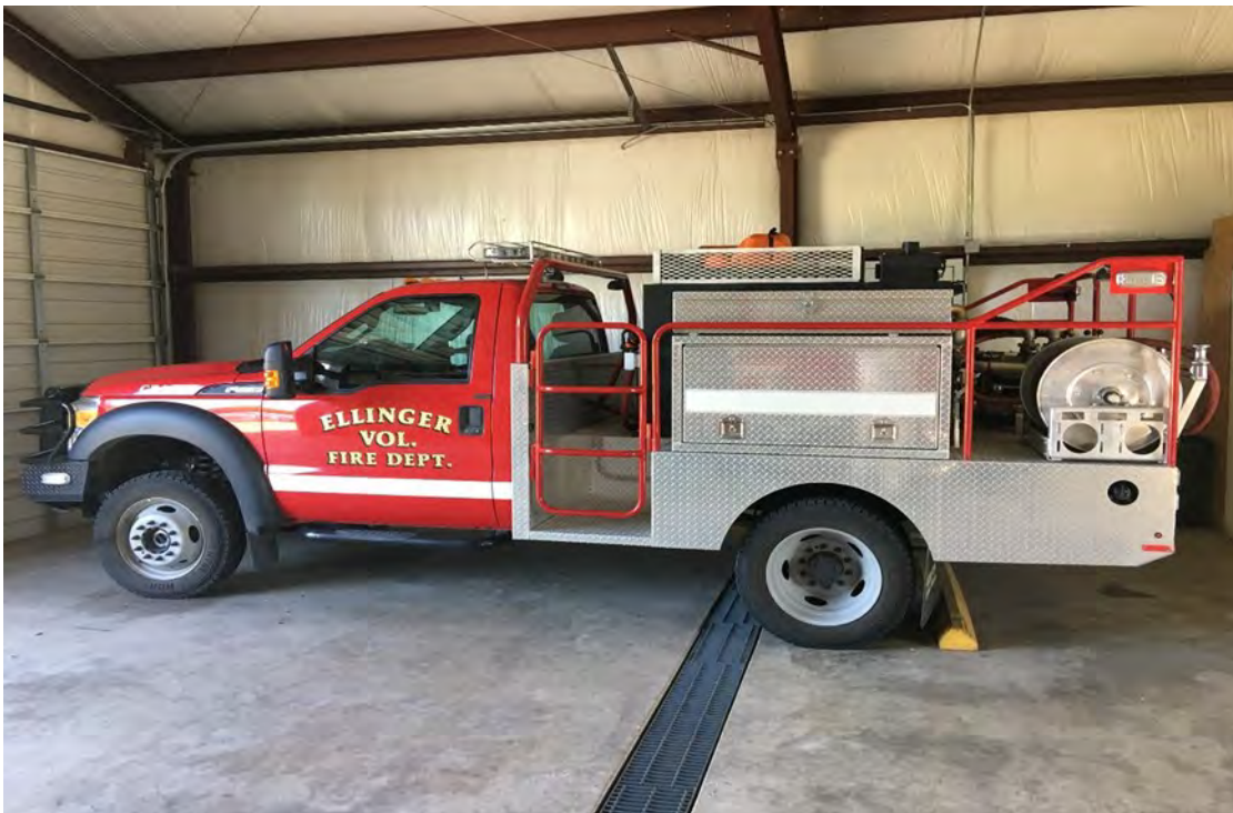
Photograph of EVFD Grass 5.