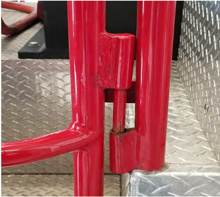
Exterior rear passenger compartment door latch.