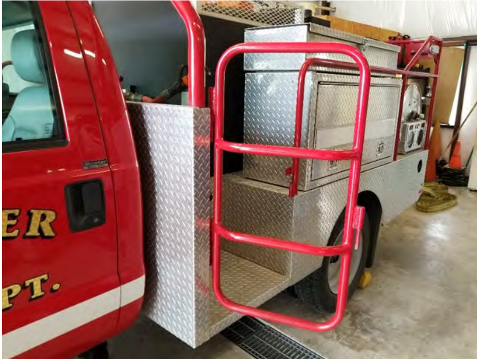
Exterior rear passenger compartment door.