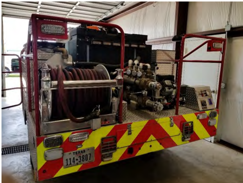
Rear of Grass 5 showing rear hose line and nozzle holder.