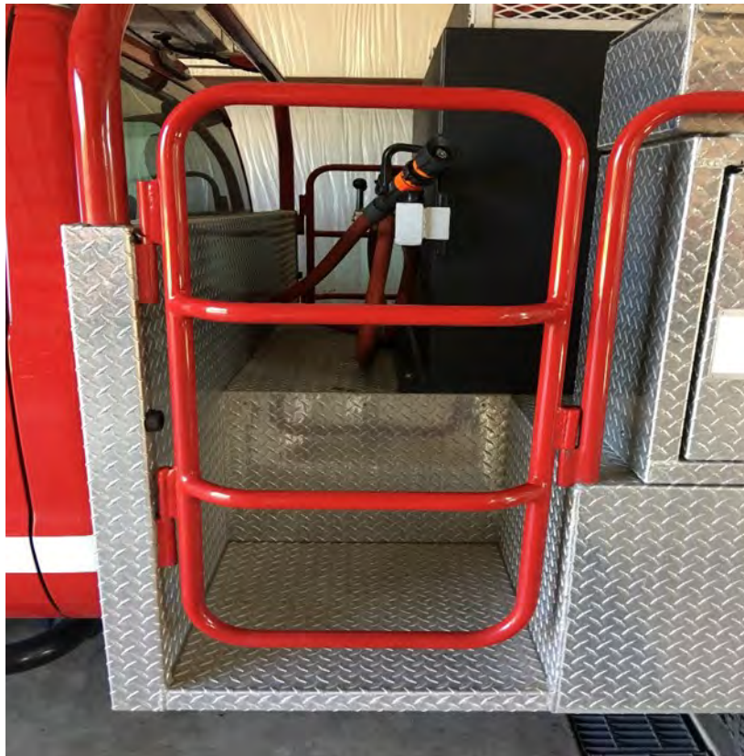
Exterior rear passenger compartment door.