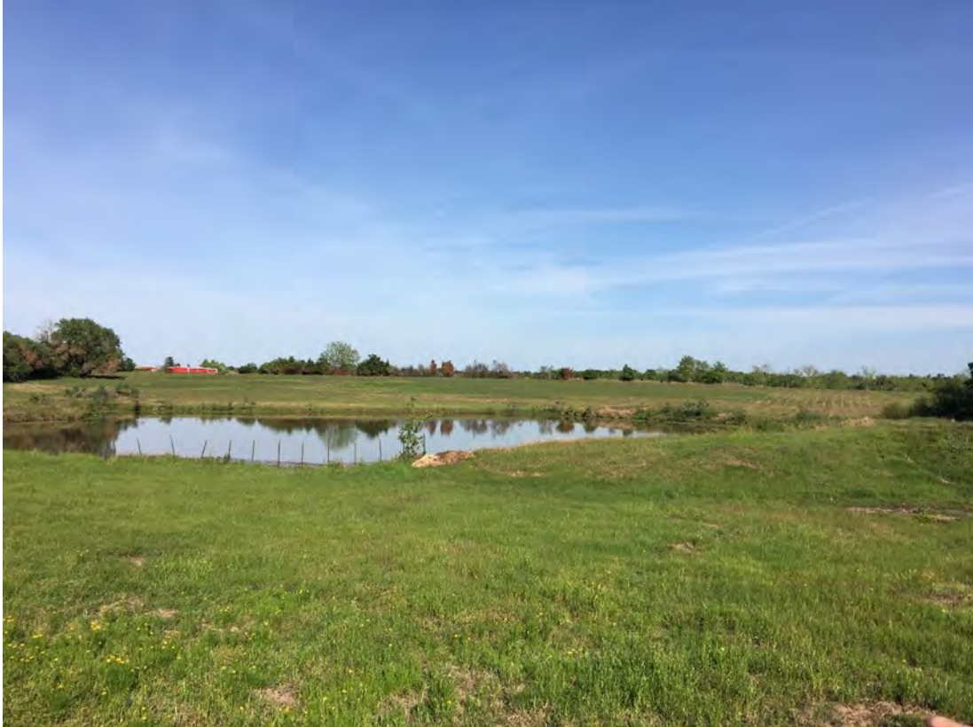
Location of wildland fire.