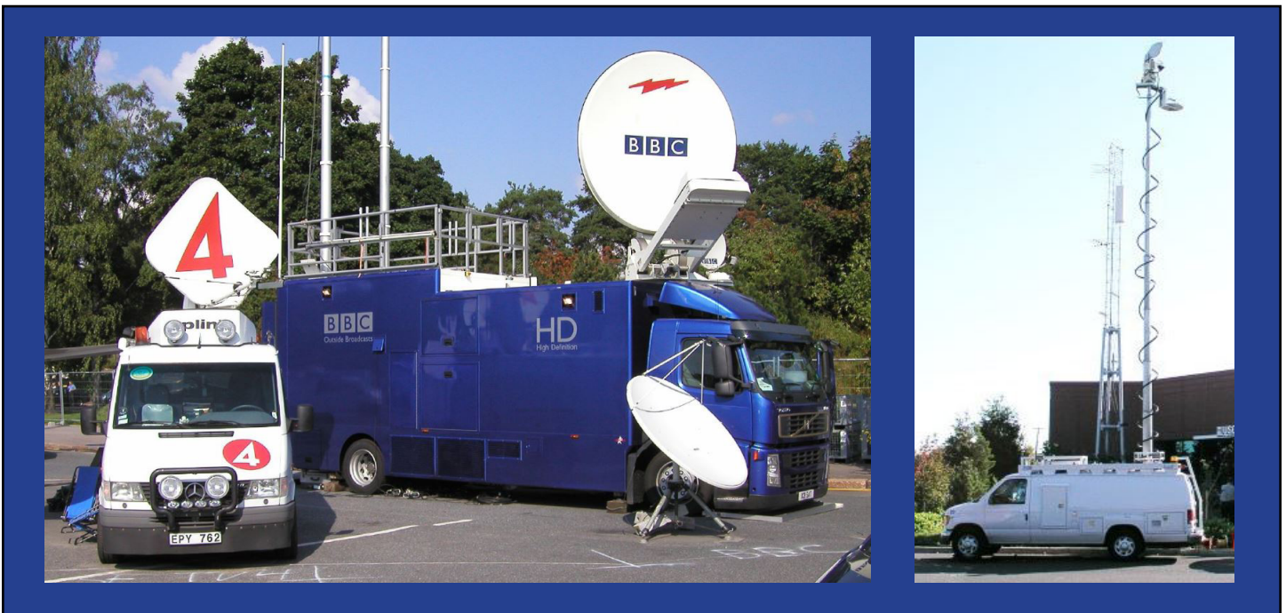
Courtesy Wikimedia Commons BBC HD SNG.jpg and MSH04 news media trucks at CVO office 10-02-04 med.jpg